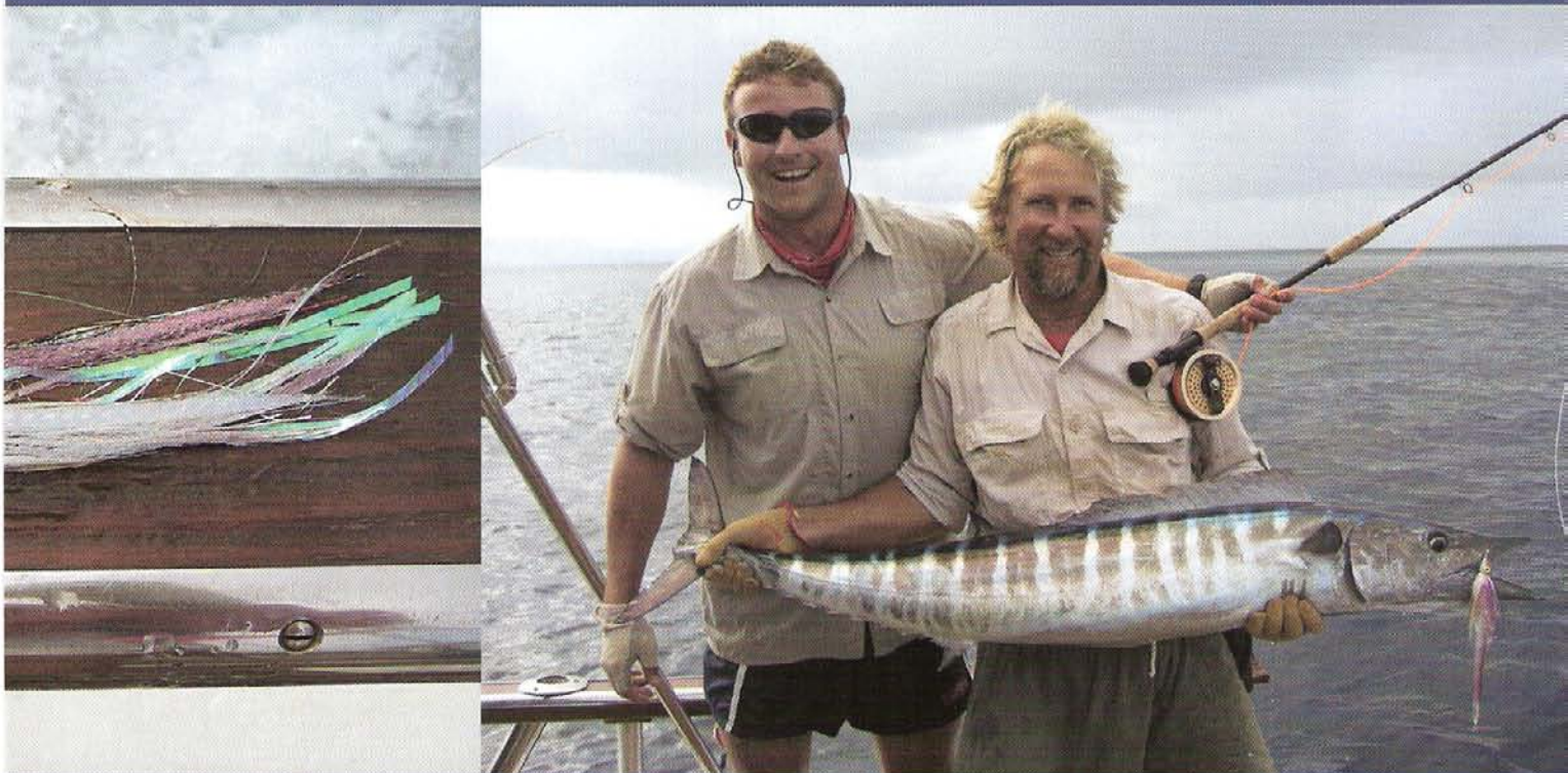
Above right: To catch wahoo on fly (as with billfish) takes great team effort, but the results are well worth it.

Wahoo and tuna both tend to do the same thing: they hit the baits once, disappear for a few seconds, then hit them again. They very seldom strike three times, so the trick to successfully hooking both species is to have your fly in the zone at the moment that they come back for the second attack. If nothing happens, then begin stripping the fly back as fast as you can, as this will often trigger a strike if the fish are hanging around. I usually make a couple more casts and retrieves just to be sure, and then we put the boat into gear and start trolling again. It is always a good idea to backtrack and go over the same area again as the fish may still be in the vicinity. Ideally, have a bucket of live bait (such as scads, halfbeaks or anchovies) onboard and as soon as the fish hit the teasers and the boat stops, throw a couple of handfuls of the live bait overboard. This will keep the fish in feeding mode and close to the boat, allowing the angler more time to make a cast to a hungry fish. This is definitely the most successful method of catching wahoo, and often results in a double hookup. If I can leave you with one bit of advice – get that fly in the water! Every time a fish strikes, stop the boat and make a cast – you will be amazed at how many hookups you get. Teasing wahoo is not as slick and smooth as teasing sailfish. It is chaotic and messy at times, but hell, it’s fun when you get it right!