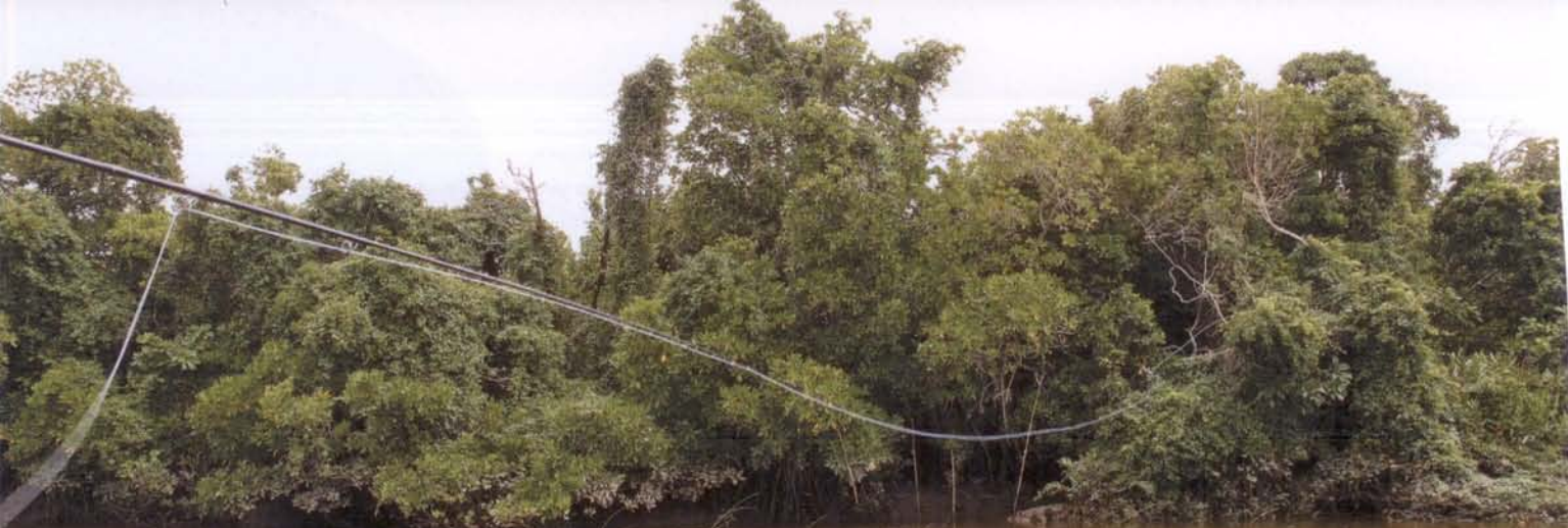
Above: The ideal habitat of submerged reeds, mudbanks and underwater structure where snapper and perch lurk. Below: Success at last for Yusuf Vanker and Yusuf Gandor. These fish were taken deep in the mangroves and, although relatively small for the species, well worth the effort.